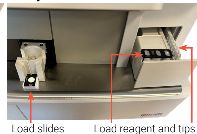
Load slides Load reagent and tip here her